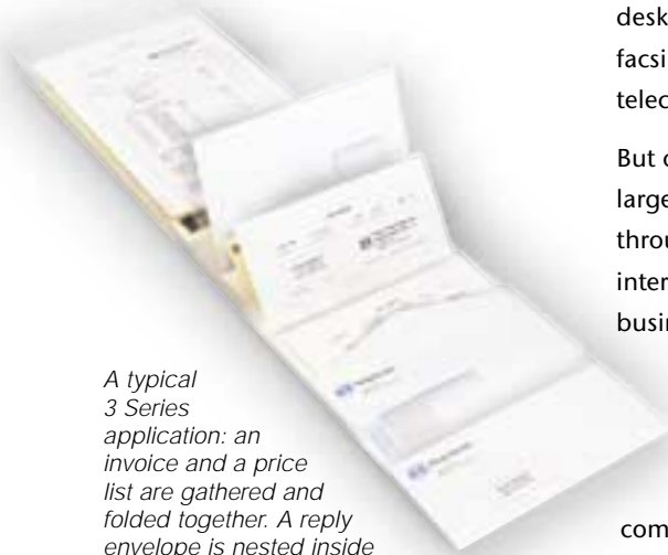
A typical 3 Series application: an invoice and a price list are gathered and folded together. A reply envelope is nested inside the folded document. The completed piece is inserted into an envelope and the flap is sealed.

And because it's from Pitney Bowes it contains the same proven technologies that are in use in the world's most demanding mailing environments.