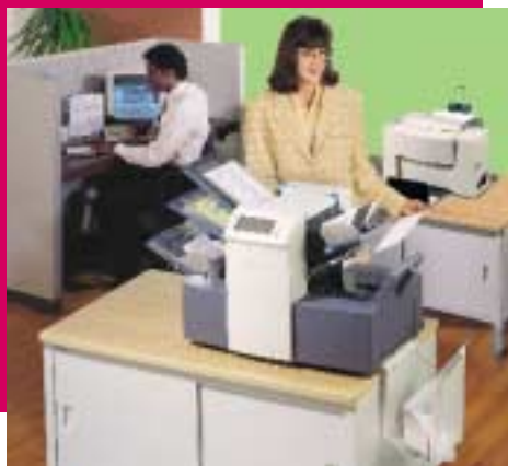
The 3 Series™ fits perfectly into your office environment.