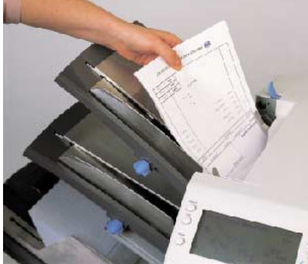
Daily Mail mode provides greater flexibility for multi-page sets

The 3 Series™ is available in a choice of 3 machine configurations, allowing greater flexibility in handling different materials to satisfy total job requirements.