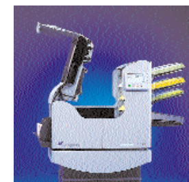
The SI 68's unique clam shell design provides easy and safe access to the entire paper path.