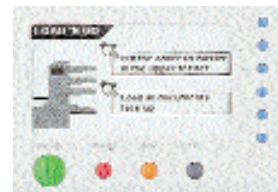
Viewing or customizing job settings is easy and convenient.

The solution? Introducing a quiet, compact, and easy to operate folder and inserter for the office – the Neopost SI 68. The SI 68 is smaller than most copiers and nearly as easy to use as a fax machine – anyone in the office can operate it. It is also so flexible – it can process just about any type of office mail, including invoices, statements, checks, letters, inserts, etc.