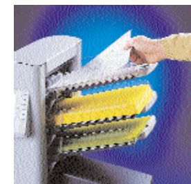
With Flexfeed®, feeders can handle many different paper types and sizes.