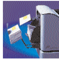
The standard SI 68 catch tray neatly stacks finished envelopes.