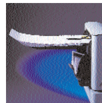
The optional conveyor stacker neatly stacks finished envelopes for easy collection and maximum productivity.