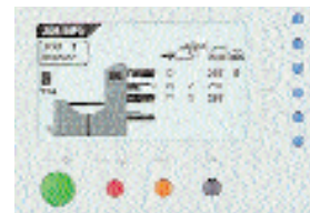
For occasional jobs choose Load & Go for automatic set-up.