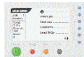
The centralized control panel makes operation a breeze with pictographs, and one-touch selections.