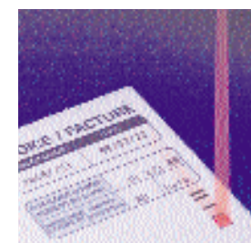
Optical Mark Recognition module (OMR) is available for grouping variable page sets of documents together automatically.