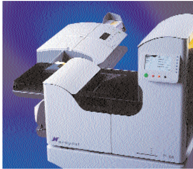
The SI 68 can work together with Neopost mailing systems for ultimate one-step ease of use and productivity.